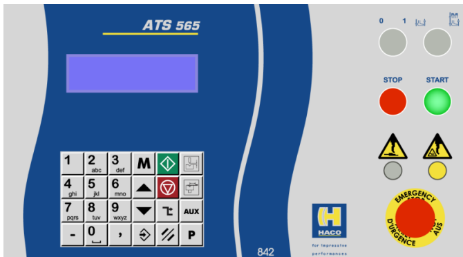
ATS 565: Fast and reliable machine control for synchronized press brakes

Low-cost CNC-control for synchronized press brakes